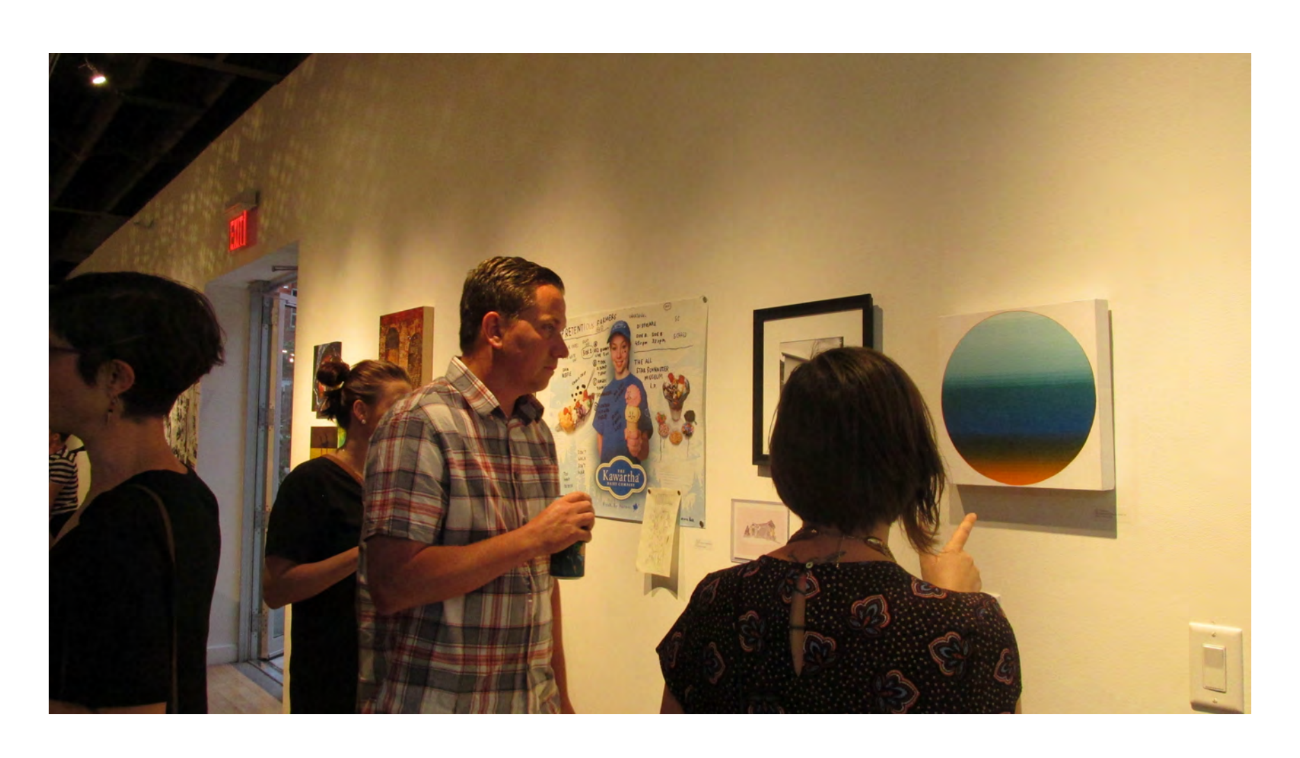
HAMILTON ARTISTS INC.

Hamilton Artists Inc. supporters enjoy work on display in our 4<sup>th</sup> annual Inc. Squared Fundraiser .