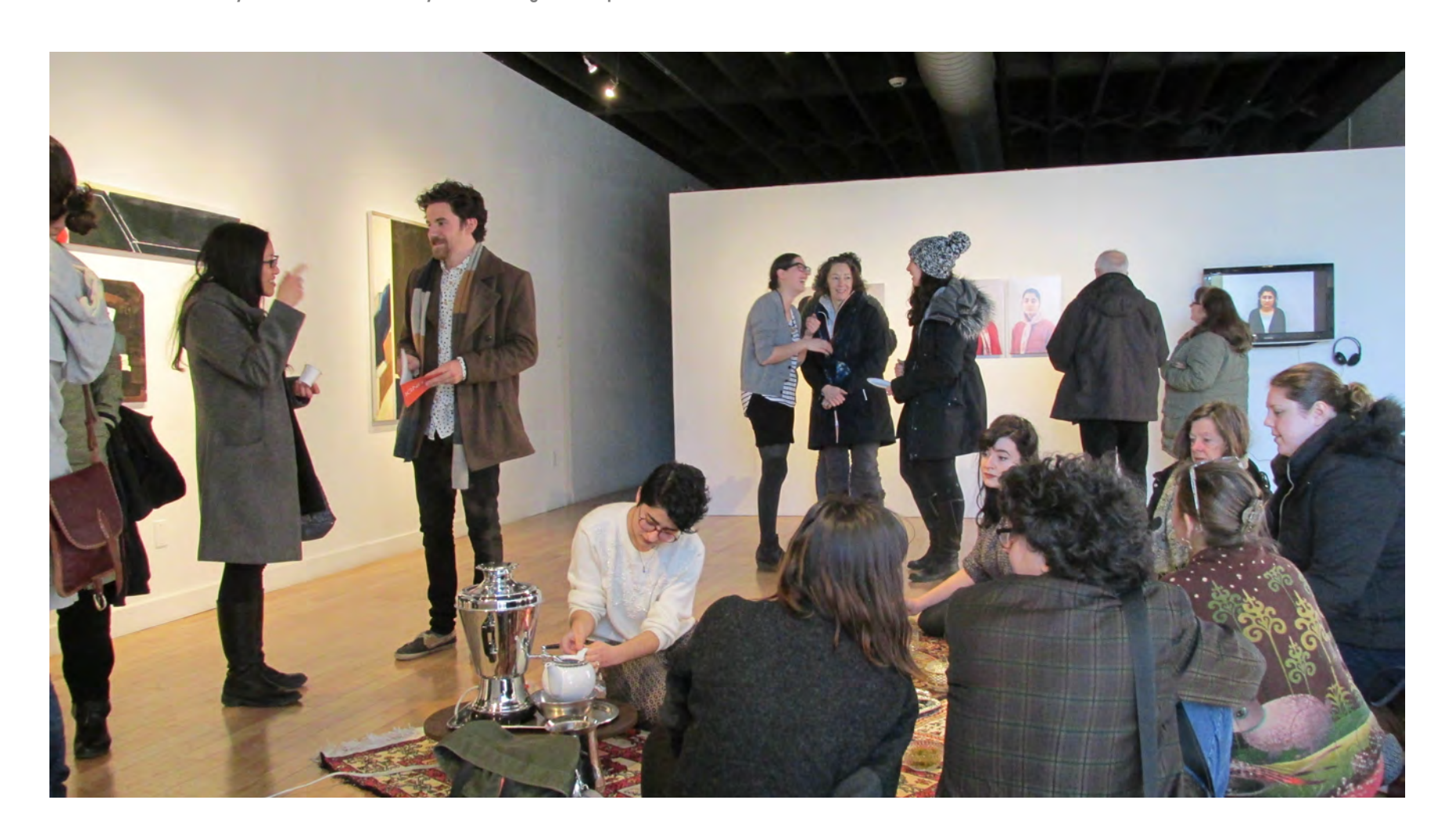
HAMILTON ARTISTS INC.