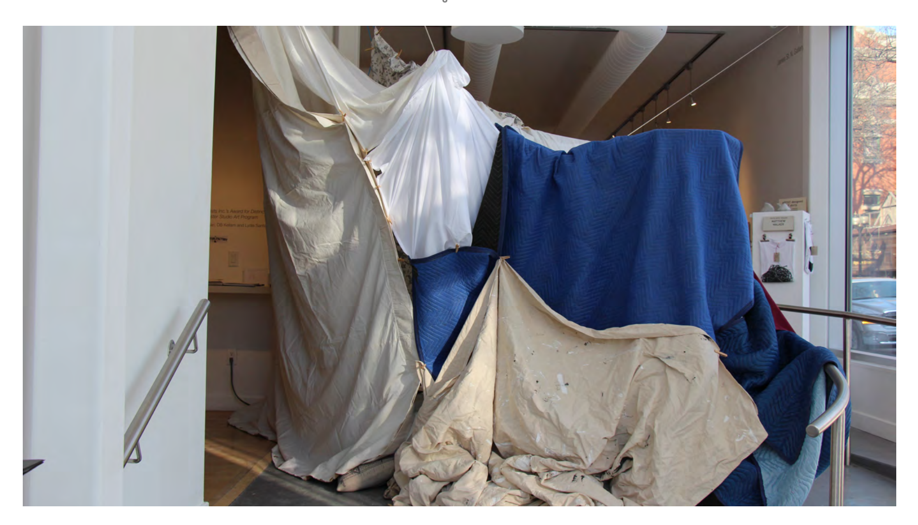
HAMILTON ARTISTS INC.

We made a blanket fort during Winterfest for obvious reasons.