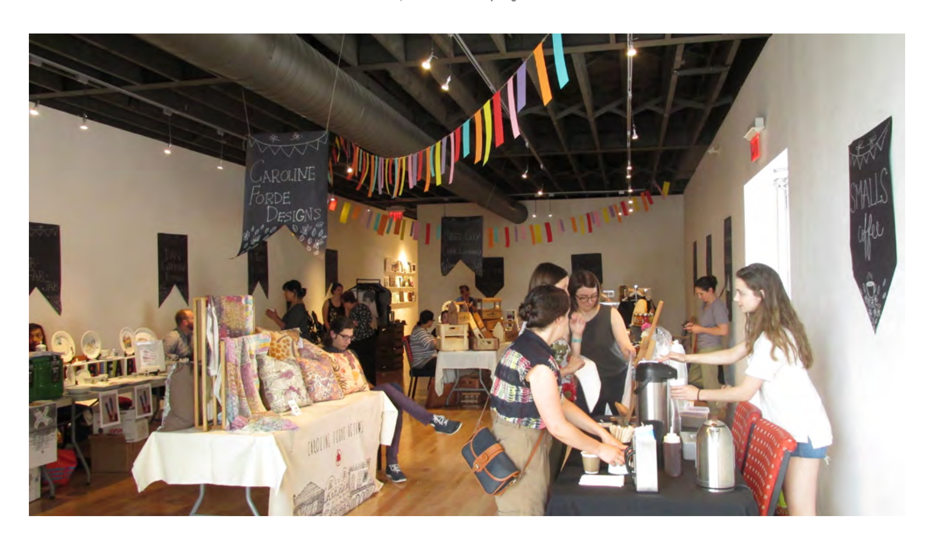
June 10 - 11, 2016: Our first Spring Craft Mart*.