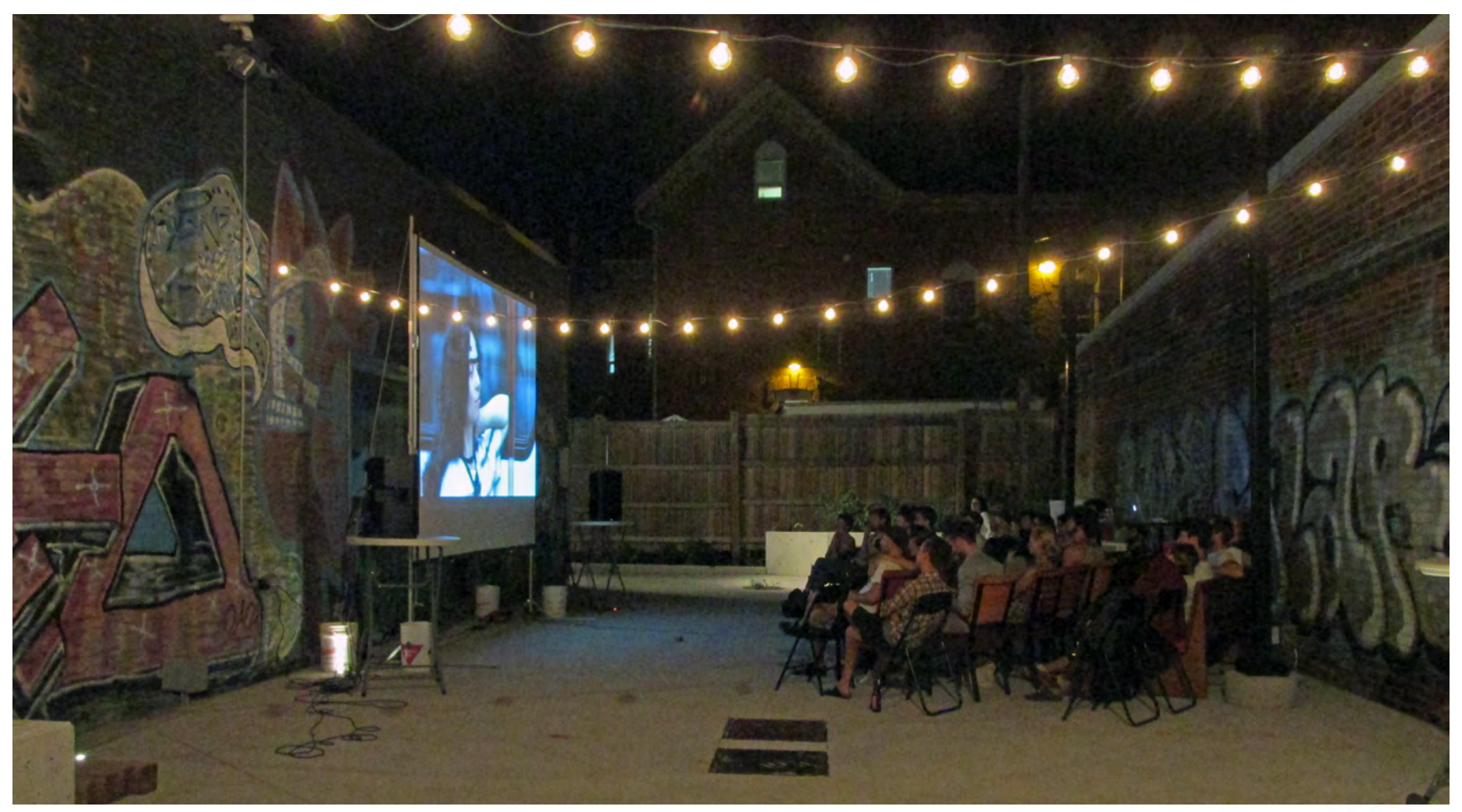
HAMILTON ARTISTS INC.