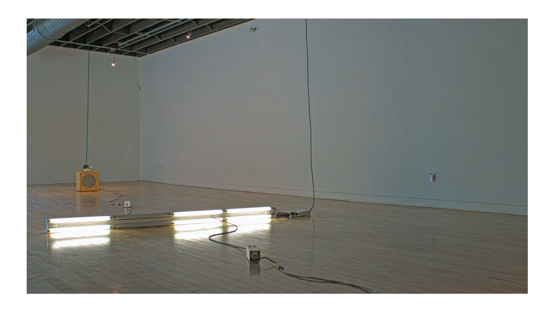
HAMILTON ARTISTS INC.

Open Ended Ensemble (Competitive Coevolution), Stephen Kelly, 2016. The work is a series of installations in which a collection of electromechanical sound-producing automatons, or agents, integrate basic attributes of a biological living system. Essay: Donna Szoke.