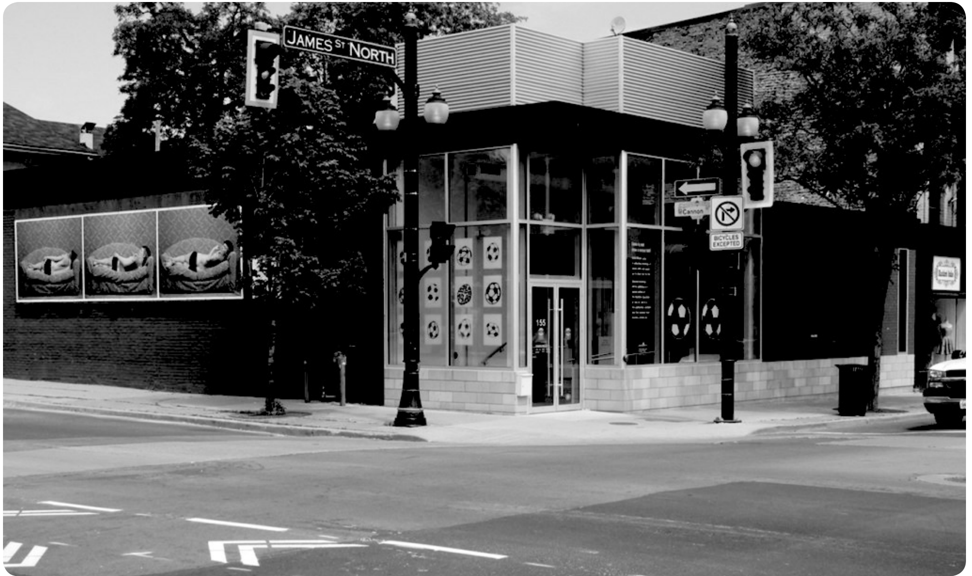
Hamilton Artists Inc.