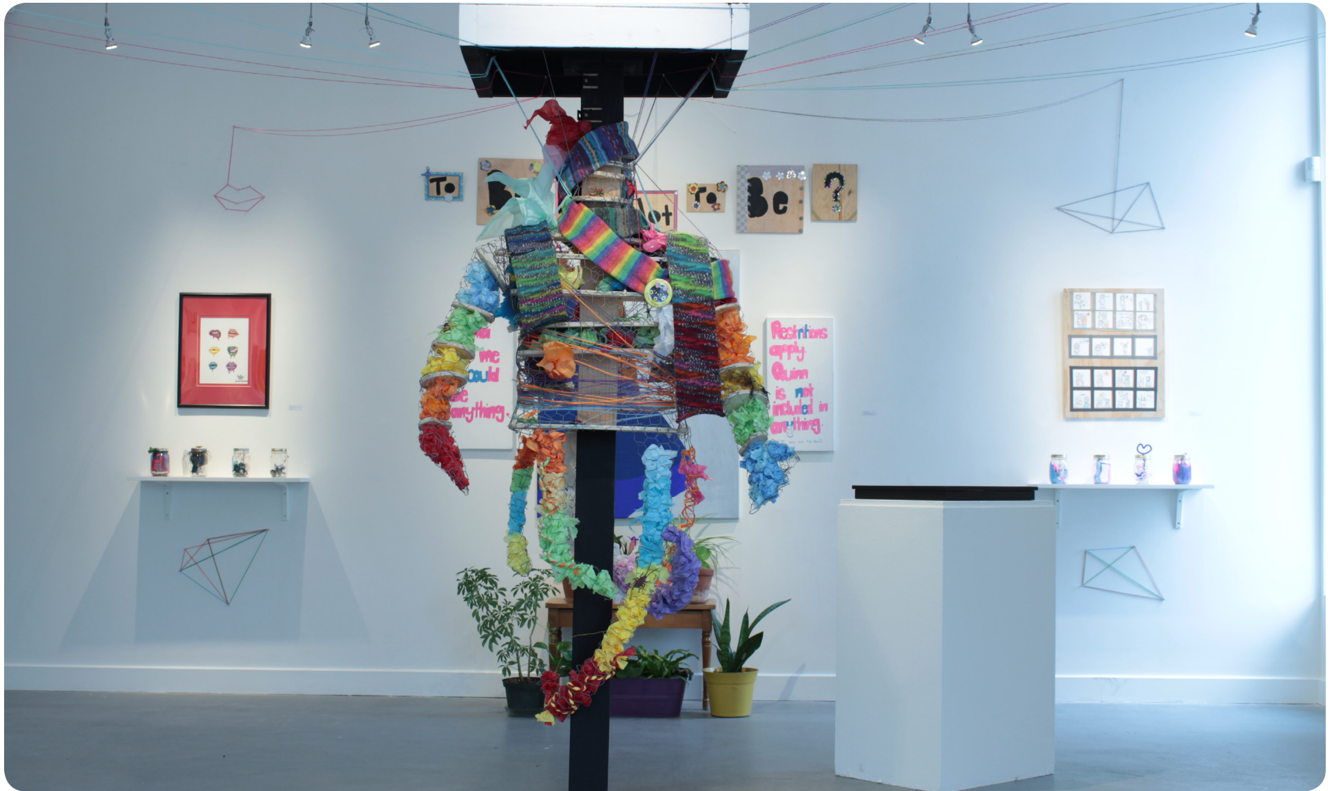
Growing Up Queer in the Hammer. RE-Create Youth Artists.