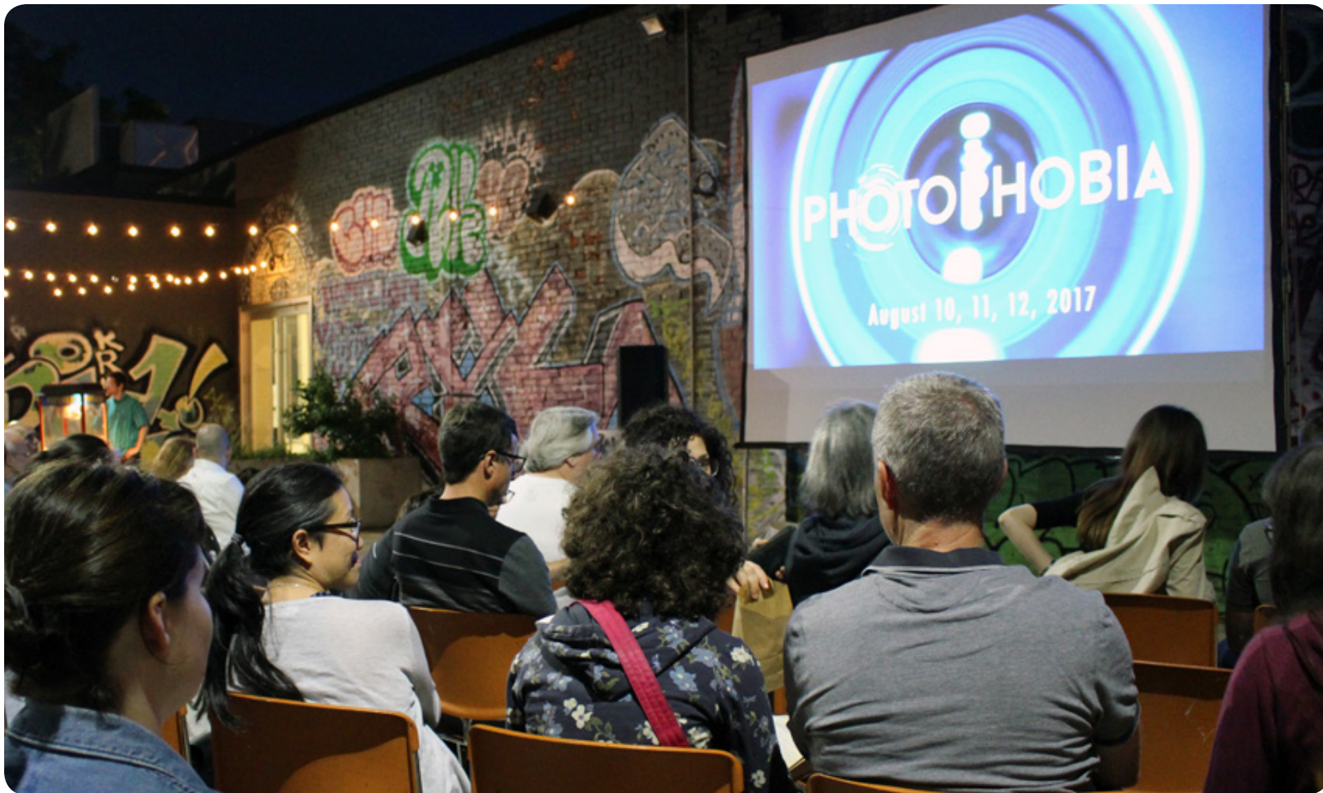
Photophobia Contemporary Moving Image Festival. Presented in Partnership with the Art Gallery of Hamilton. August 10–12, 2017.