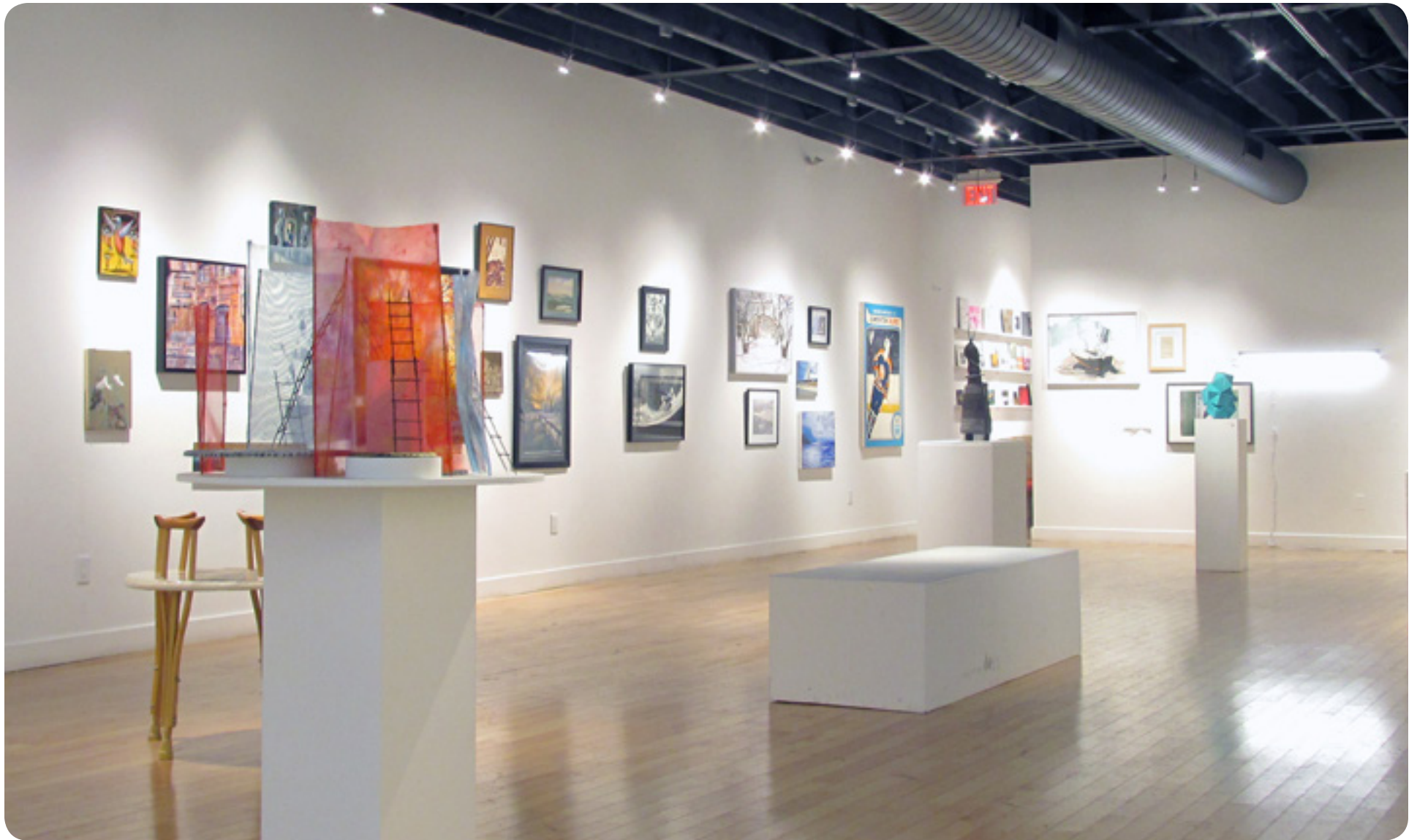
SWARM 2016: Annual Members Exhibition. This exhibition showcased the original artwork of our members, representing the richness and diversity of artistic practices in Hamilton.