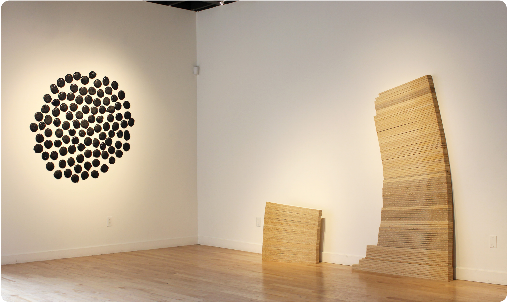
Lump, Slump, Sunk , Adrienne Spier . April 7 - May 12, 2018.