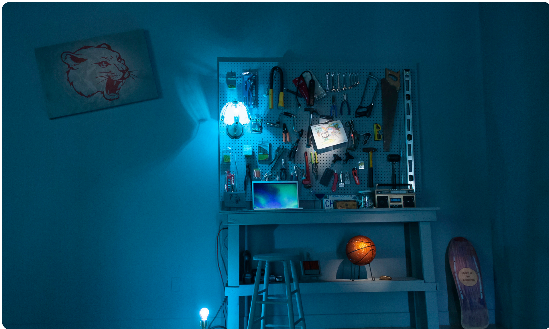
Chapter VI: Greysville / THE IMPOSSIBLE BLUE ROSE , Lisa Lipton . September 8 - October 27, 2018.