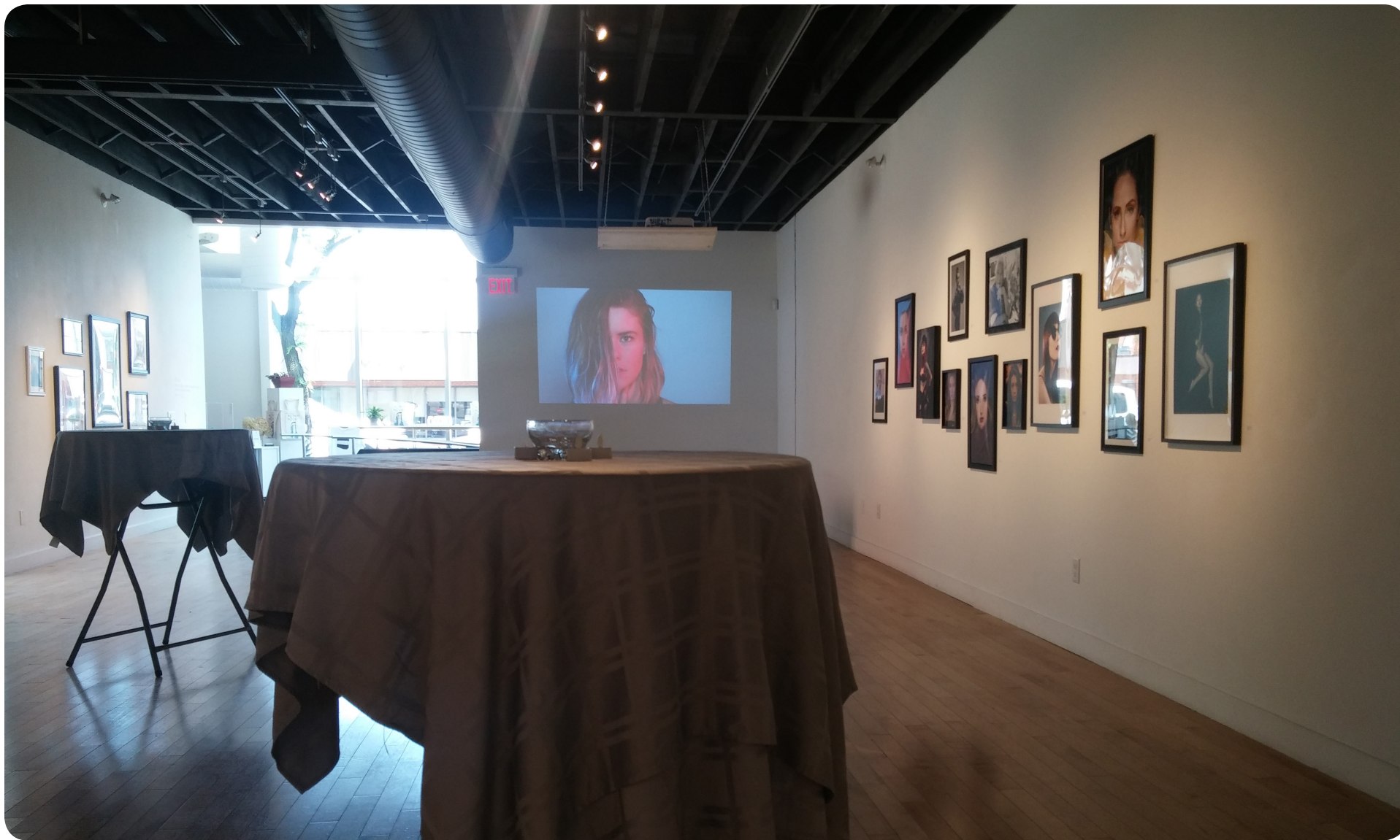
Focus: Mohawk Creative Photography Graduate Exhibition. May 19 – May 26, 2018.