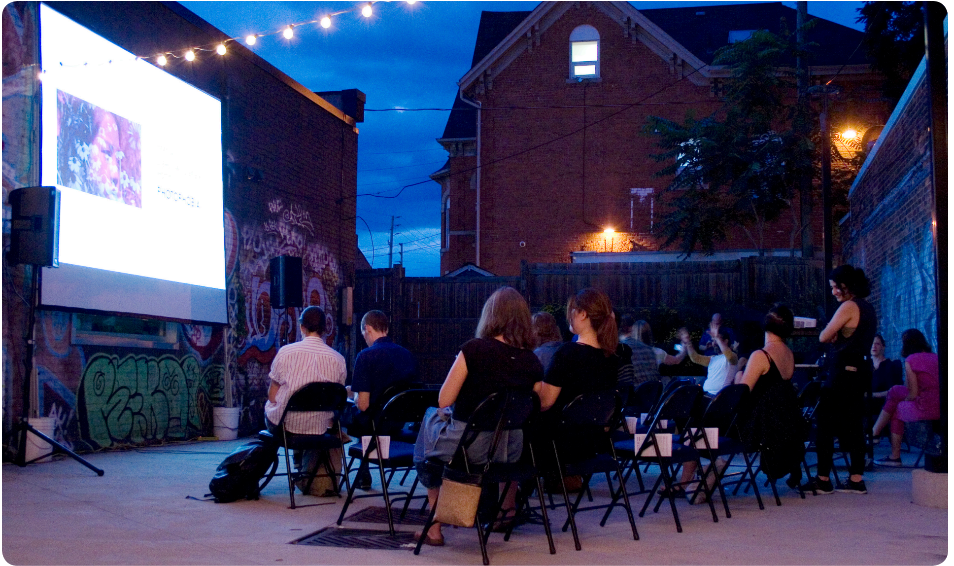
Photophobia: Contemporary Moving Image Festival. August 11, 2018, 8:00-11:00 pm.