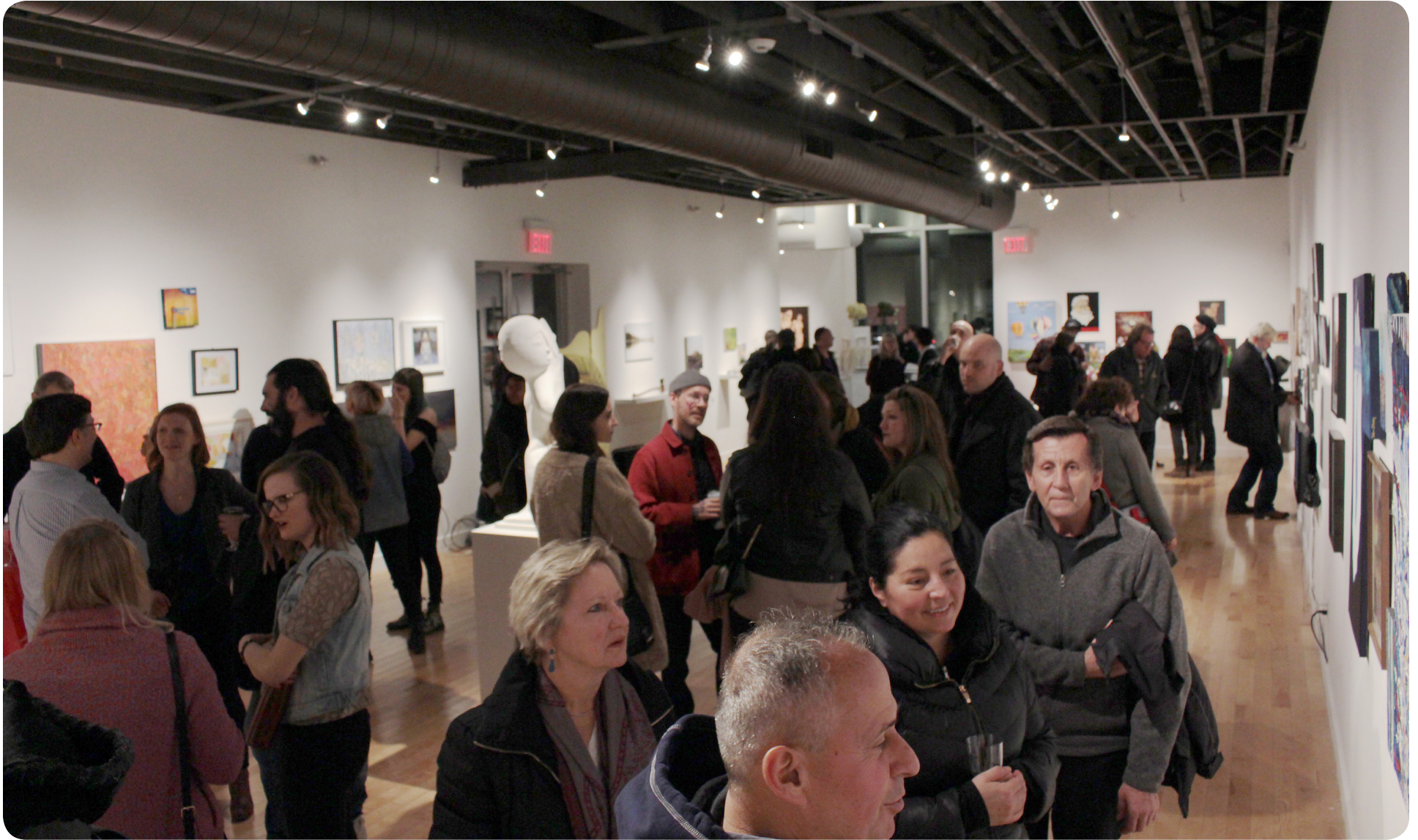
SWARM, Members Exhibition. November 25, 2017 - January 13, 2018. Photo: Caitlin Sutherland