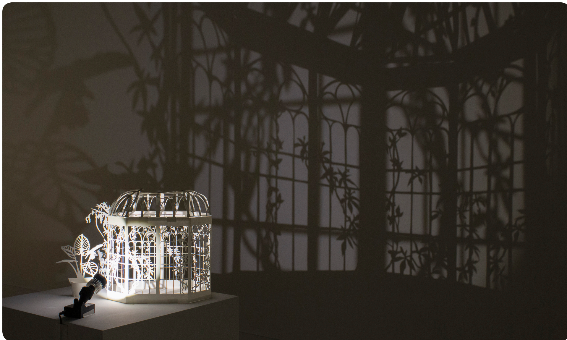
Winter Garden, Mere Phantoms. March 30 – May 11, 2019.