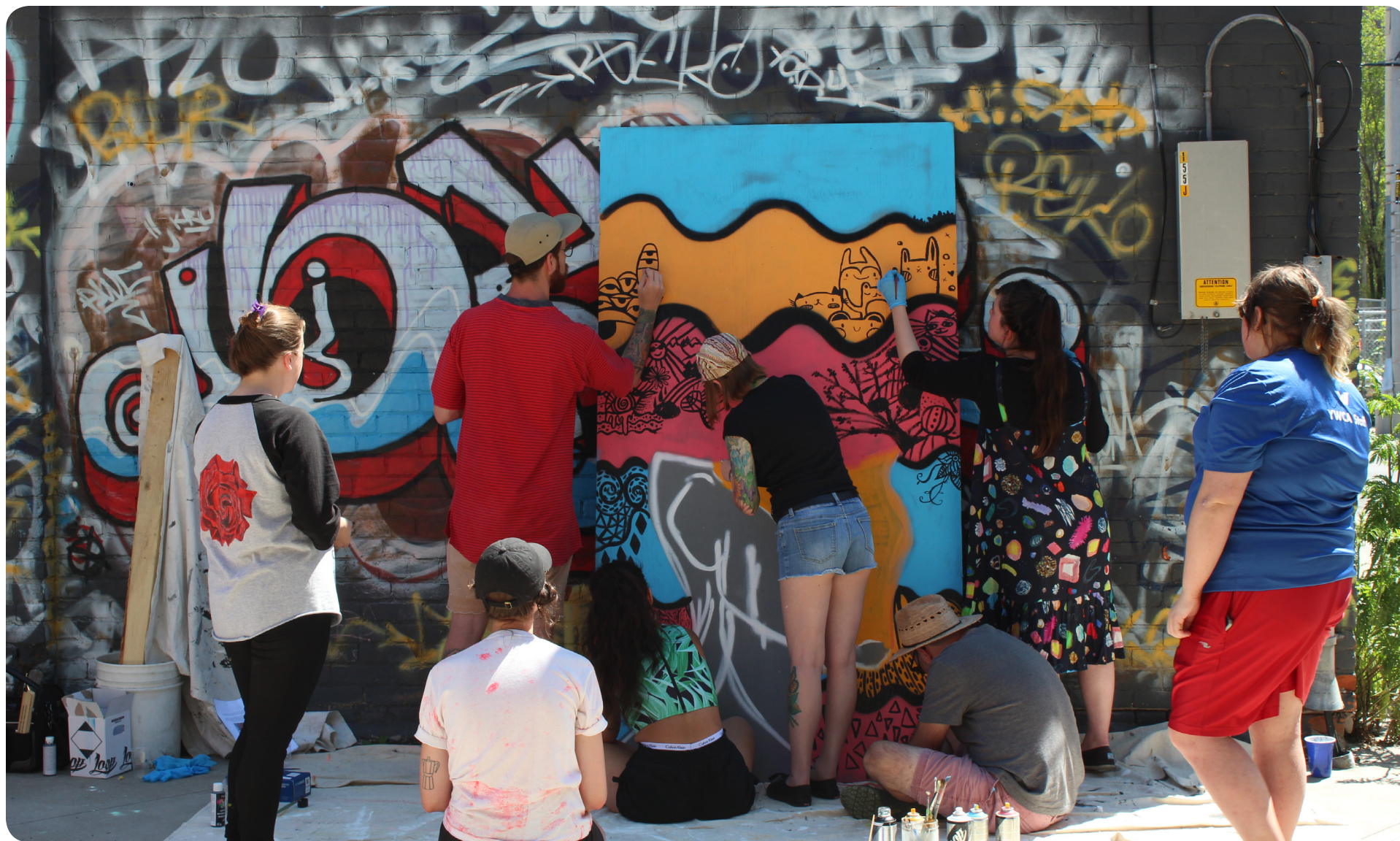
Collaborative mural project with Clear Eyes Collective and Hamilton Public Library . June 22, 2019.