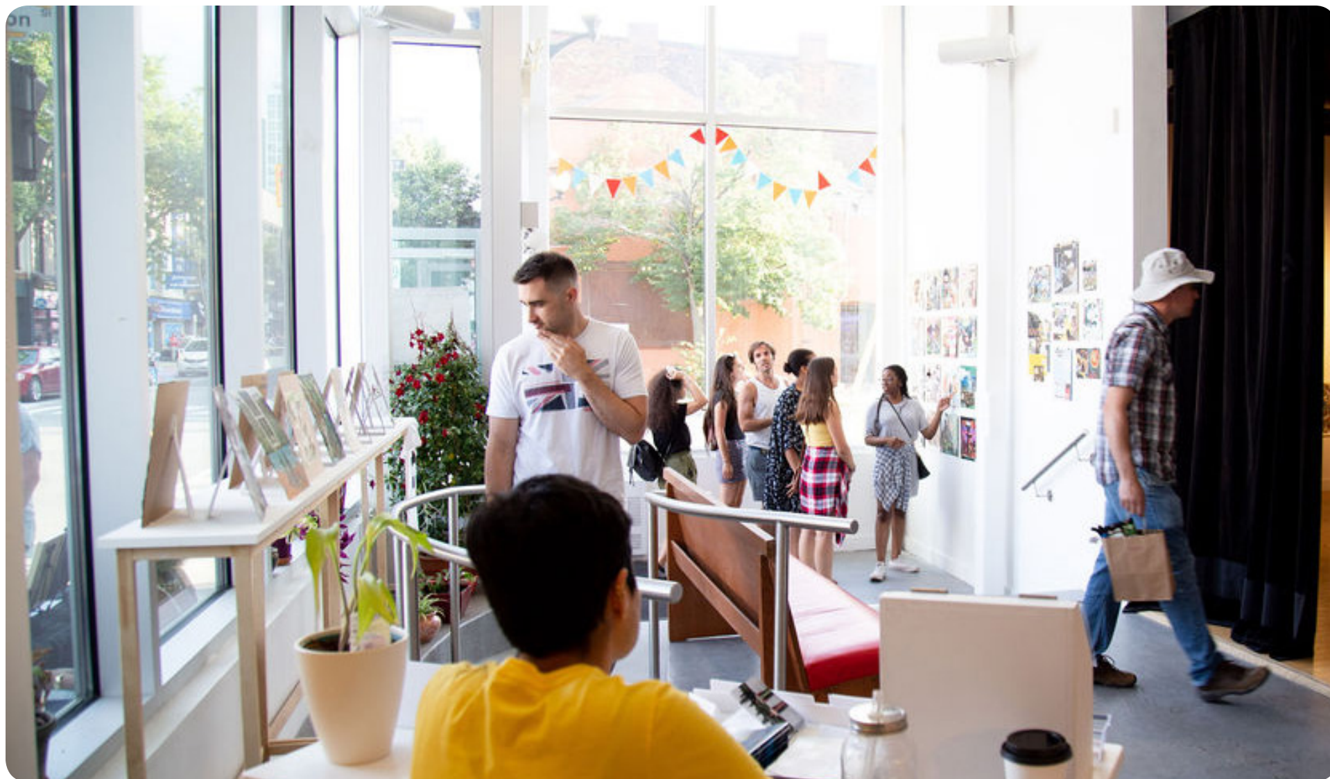
UNSTUCK pop-up collage exhibition. August 9, 2019.