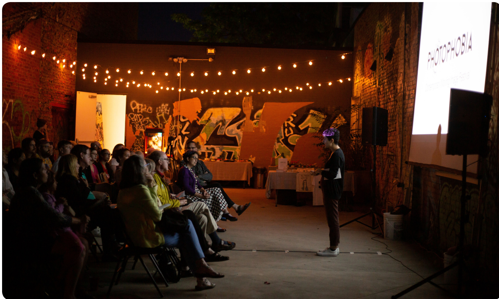
Photophobia: Contemporary Moving Image Festival, August 10, 2019, 8:30 – 11:00.