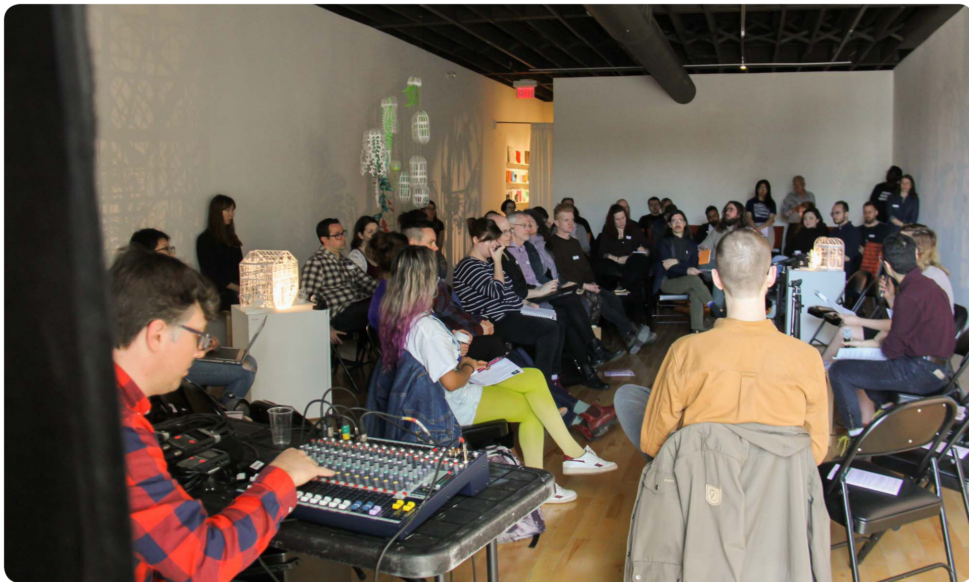
Pressure Points: Gentrification and the Arts in Hamilton. April 12-13, 2019.