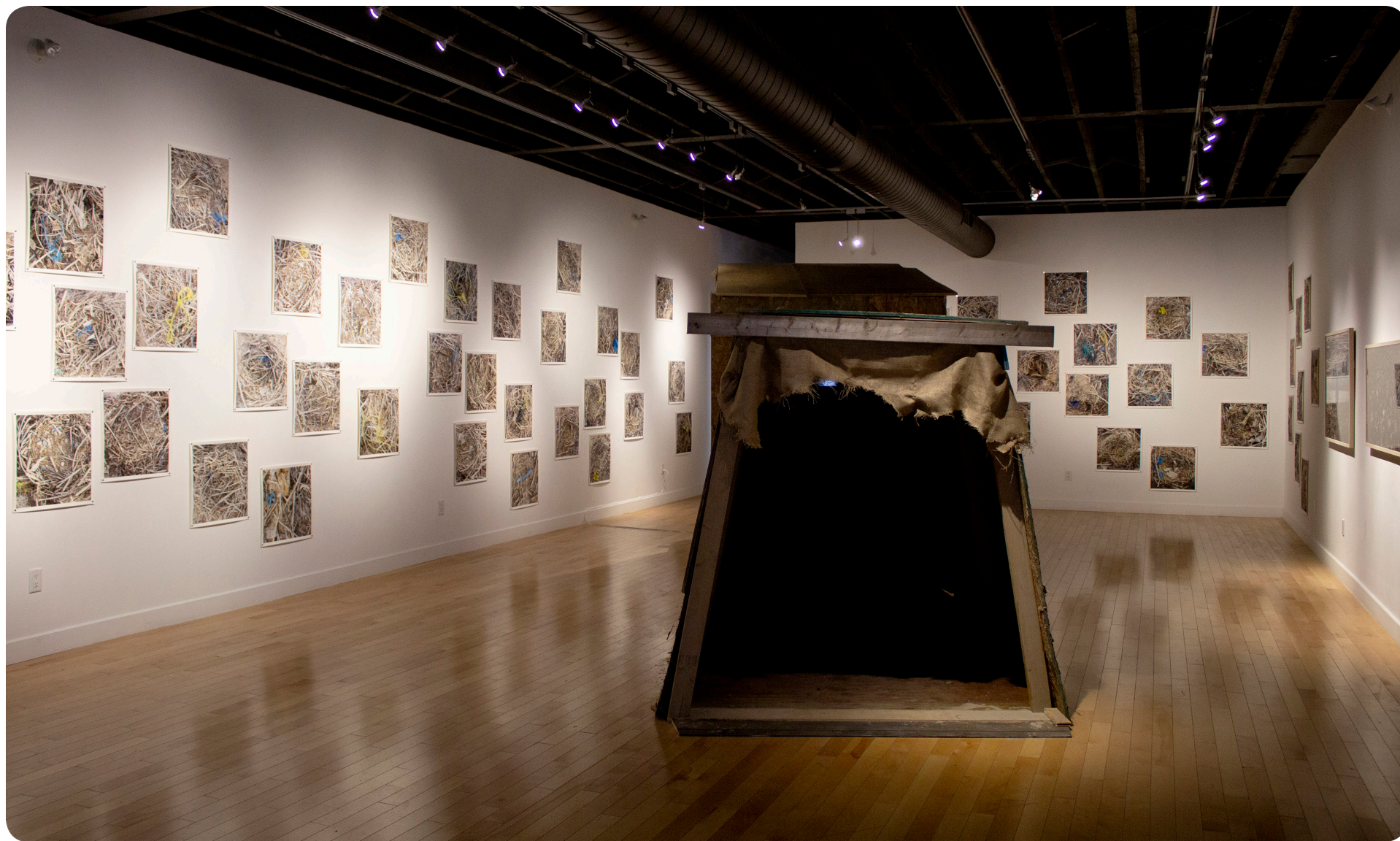
Devil's Colony , Cole Swanson . June 8 – August 10, 2019.