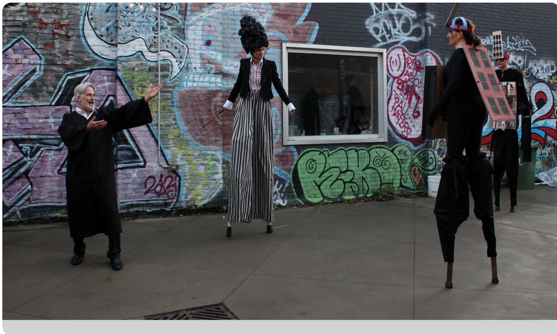
The Hanging, Red Betty Theatre and Hamilton Aerial Group. April 12, 2019.