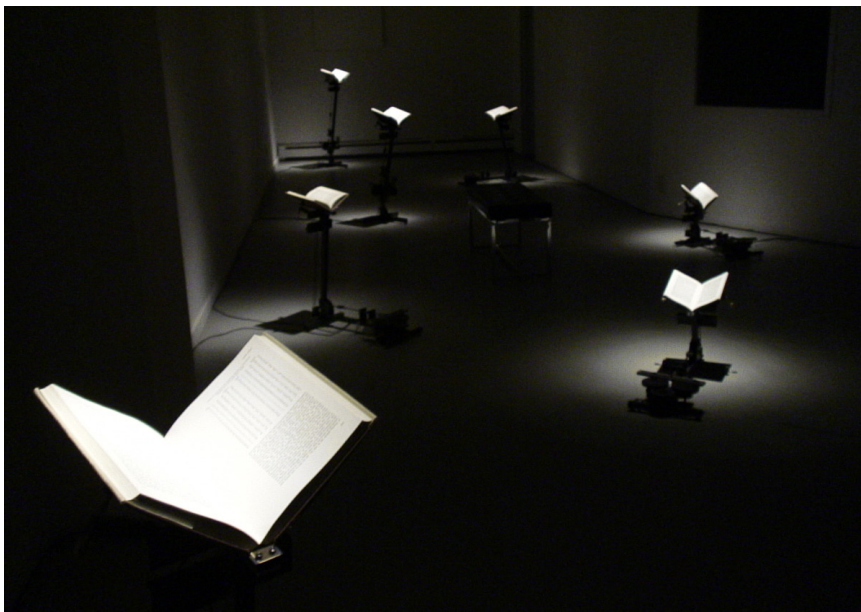
Installation view

A joint publication between Hamilton Artists Inc. & White Water Gallery