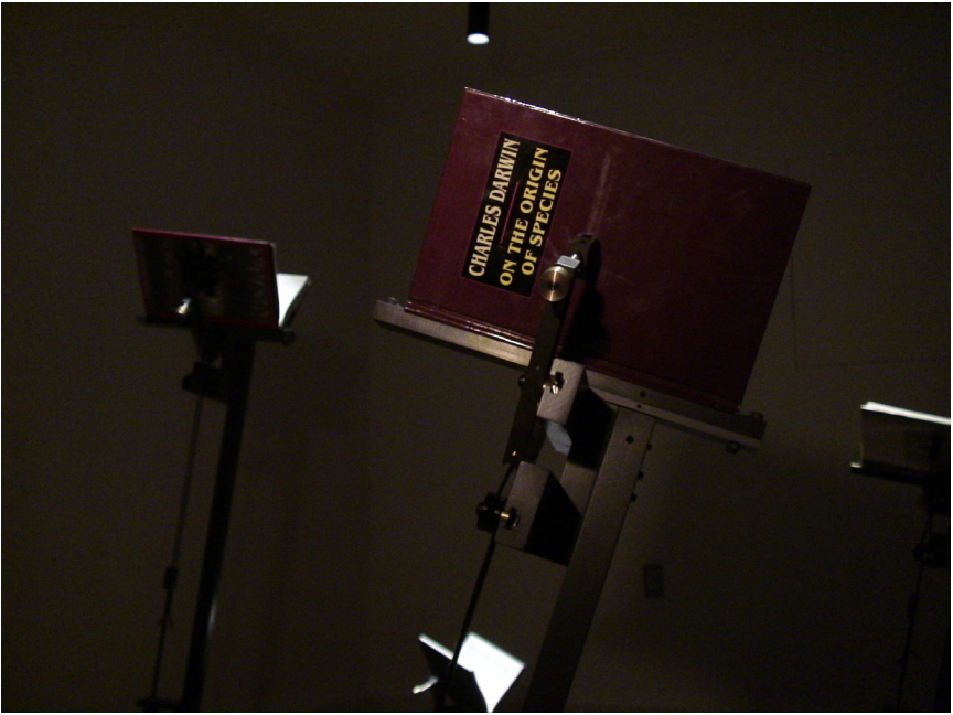
Installation view. Image courtesy of the artist.

action as well as the apocalyptic consequences of collective action. Nietzsche's übermensch are not liberated individuals whose enlightenment encourages an enlightened civilisation, but rather liberated corporations-as-people whose will is reshaping the entirety of the 'natural' world. Certainly , we say to ourselves to retain our frayed confidence in the aesthetics and philosophy by which humanity has defined itself as the pinnacle of reason and the irrational alike, a pinnacle which has brought onto the Earth a global technocratic industrial civilisation fuelled by consumption and which, for better or, much more likely it seems, for worse, alters the entirety of the global ecosystem in its image, the fact of design is and must be a human fact . Welcome to the era of the anthropocene. And so we come back to social conventions and the power of ideas.