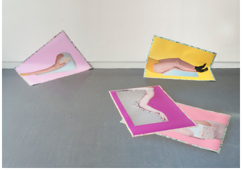
Josée Aubin Ouellette BODY BLOCKS 2015